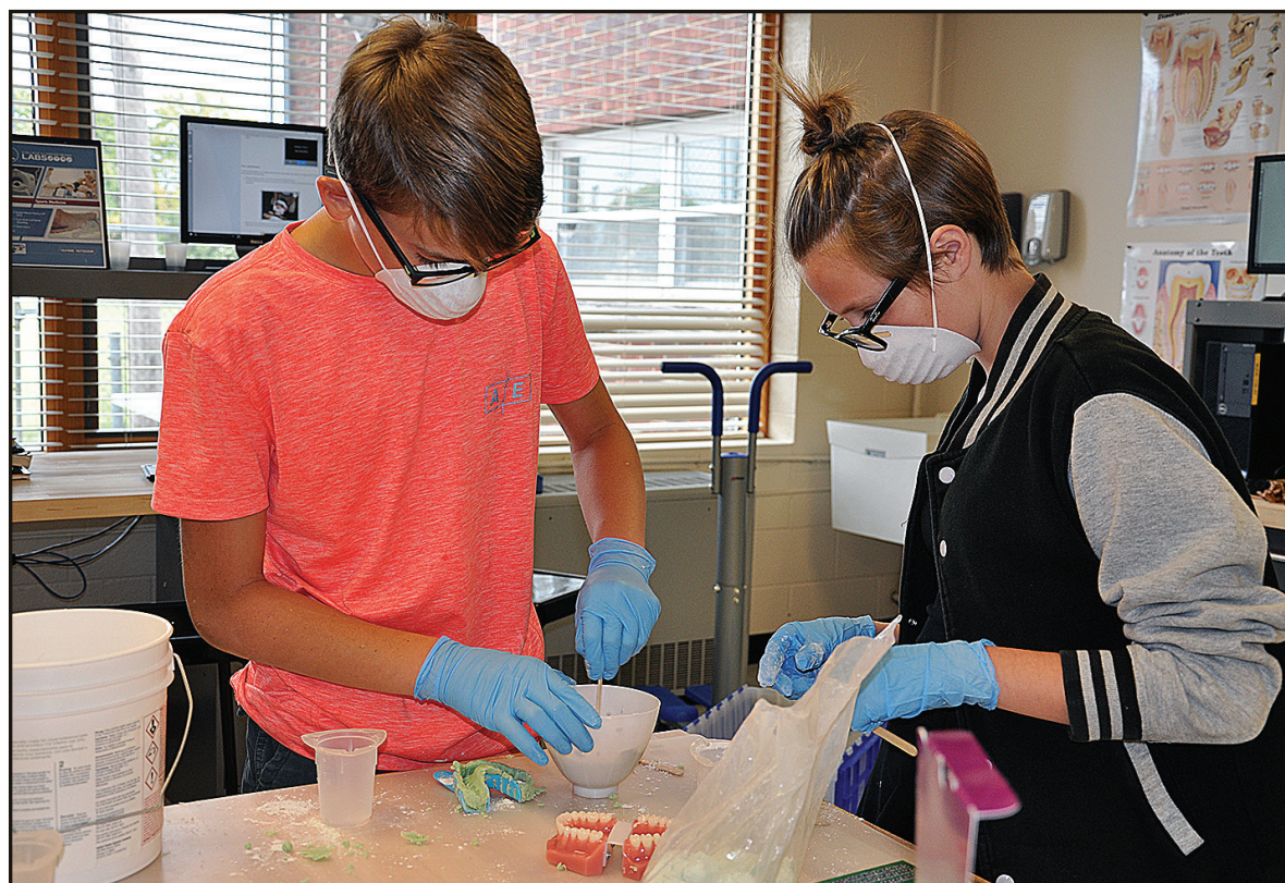
MJHS students gain hands-on experience in Dentistry as they collaborate together to make molds of teeth in the Career-Maker STEM Lab.

Students have the opportunity to choose and actively participate in three modules over the course of