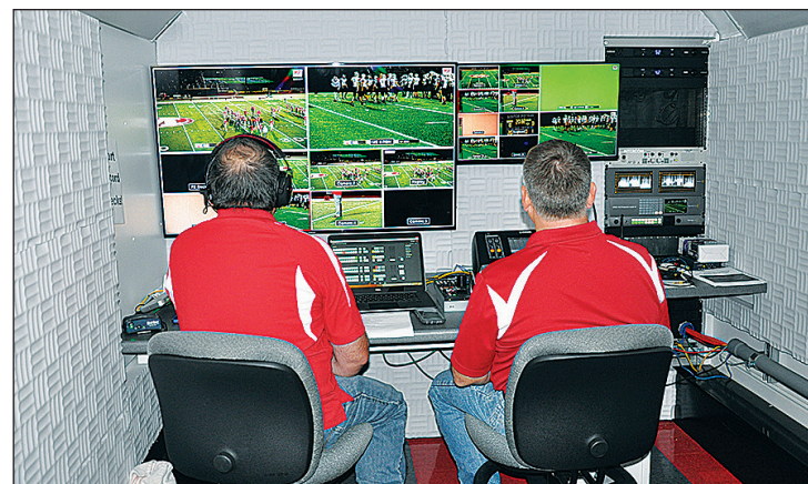
An inside look of MPTV's mobile TV broadcasting trailer.