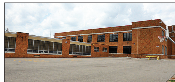
TOP: PE class in the new gym at Lettie Brown. ABOVE: Windows on the east and west of the school building with new windows.