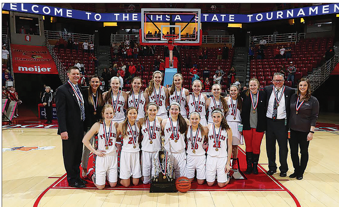
The Lady Potters third consecutive State Championship in 2017 at Illinois State University's Redbird Arena.